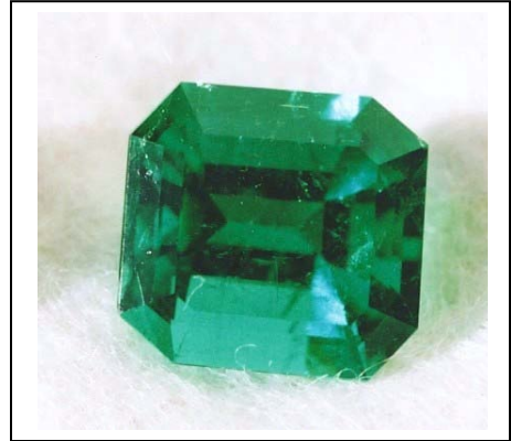
A 4.94 Colombian emerald from Muzo

E is for Emerald, the green variety of the beryl family of gems that talks about spring and life that comes around again and again. It has been the gem symbolizing beauty and constant love for centuries and a fine quality emerald can be more valuable than a fine diamond equal in size. Emeralds have been in circulation for more than 3000 years and for centuries people believed that emeralds are good luck gems, and by wearing one, it will enhance one's well-being.